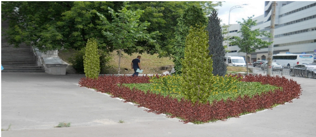
Fig.2 Ladder of the left wing and entrance group

A special issue was the use of large-sized plants for landscaping the front of the building, while there was a need to consider yet another important factor - the reaction of public opinion to both the biodiversity of urban planting and the landscaping process as a whole [15,16]. As a result, a variant was proposed that visually brought out the beauty of the facade in a row planting of Pópulus álba . The fact was taken into account that the selection and placement of tree-shrub vegetation, which is part of the compositional solution, should be approached from an ecological point of view, i.e., subject to the requirements of plants to environmental conditions. The assortment of plants for green construction is determined on the basis of a complex set of requirements that take into account the climatic conditions of the area, the intended purpose of the object, the natural features of the green area (soil, relief, hydrology, insolation, etc.), and architectural and planning situation. Each plant, especially a separate one, has its own individual characteristics. At the same time, in group plantings, trees and shrubs have the ability to “grind” to each other, forming not a set of separate plants but a single interconnected group that has a certain ability to form a balanced volume [17]. This shows, for example, a decorative-shrub group laid near the side stairs of the left wing (Fig. 2).