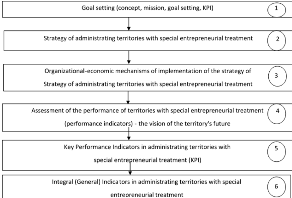
Figure 1. Assessment of the performance of territories with special entrepreneurial treatment

In accordance with the institutional- synergistic approach to the creation and functioning of special territories, it is proposed that management efficiency and effectiveness be carried out according to a specific algorithm (Figure 1).